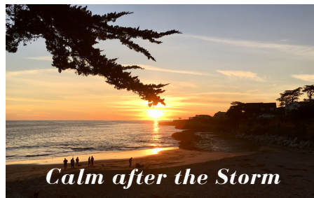
Calm after the Storm