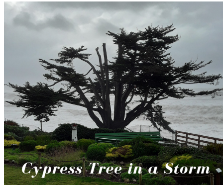
Cypress Tree in a Storm

This Winter, along with the rest of California, Villa Maria experienced an unprecedented barrage of rain, wind and cold; followed by more rain, wind and cold! The fence encircling our icon Cypress Tree was completely wiped out and waves crashed up into the garden from all sides. In the month of January, we experienced a power outage, which resulted in a unique retreat experience for our onsite group. Despite the challenge, our kitchen team still managed to prepare a hot meal for the guests - using gas stoves and battery operated lanterns! Once the rain stopped, Alex, our maintenance manager, was able to install a replacement wooden fence and put things back in order in the garden. We are so thankful to all of you who wrote expressing concern for the Sisters and the Villa in the midst of the storms. The ocean waves were raging, and the wind was howling, but in faith, having been built on a firm foundation....(we) can withstand whatever comes our way. Matthew 7:24-29